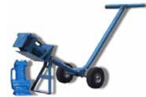
HCP Manual Lift Cart