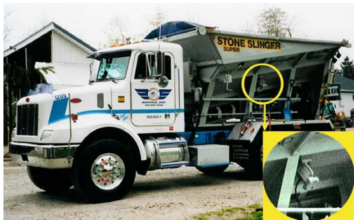
Vibrators for Dump Trucks