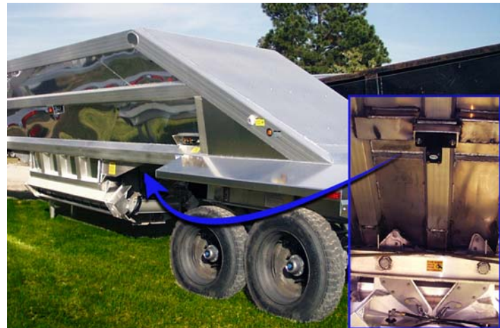
Vibrators for Hopper Bottom Trailers and Belly Dumps