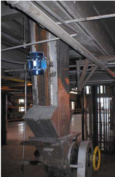
Above: NAVCO offers electromechanical vibrators that work well in a variety of power plant applications.