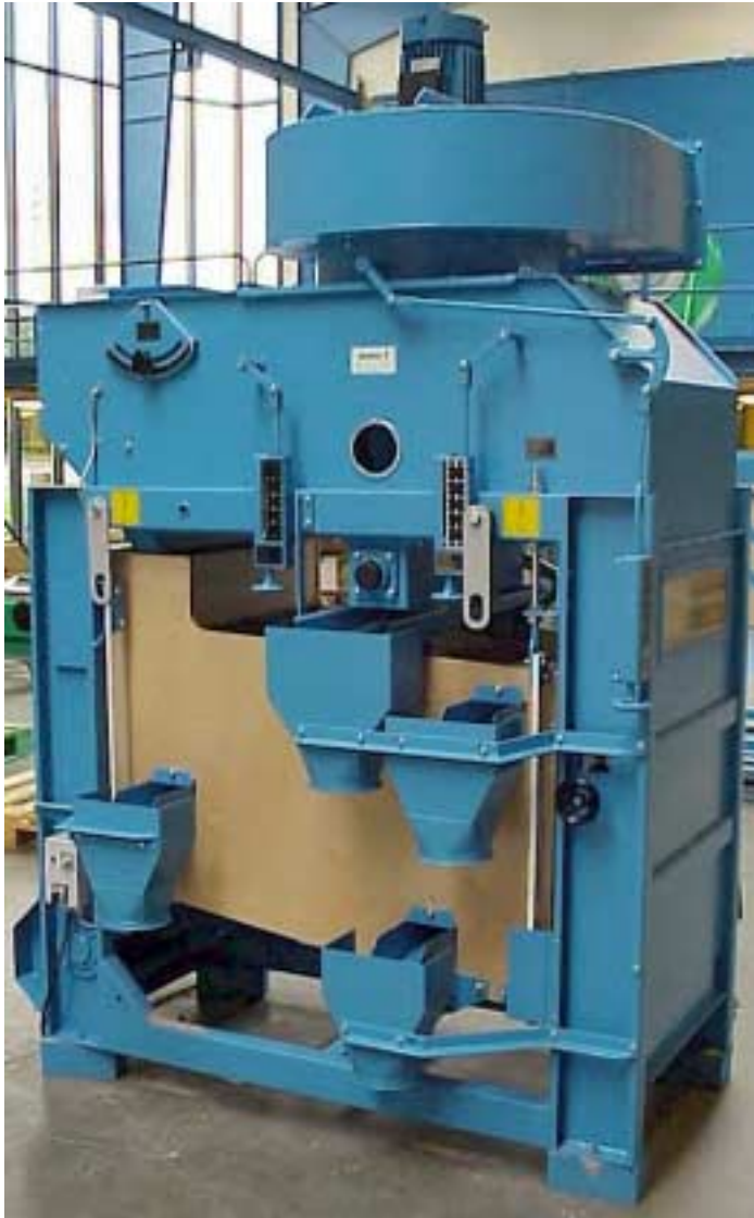
Westrup GSU-600: With a highly efficient air system, it is the perfect machine for small lots of high-value vegetable seed.

The standard features are: 6.4" diameter steel feed roll, pre-aspiration and tall final air column, air settling chamber with calibrated air valve controls and right side cull discharge, fixed speed eccentric drive and main shoe with a total of three main screen layers .