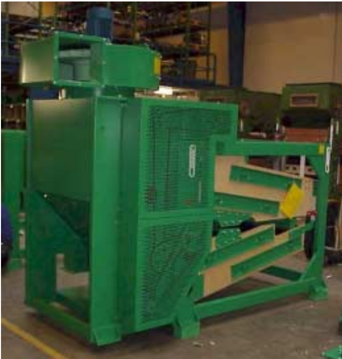
Westrup AS-1500: With four screen layers and an efficient air system, it is the perfect machine for pre-cleaning grain at small/medium sized operations.