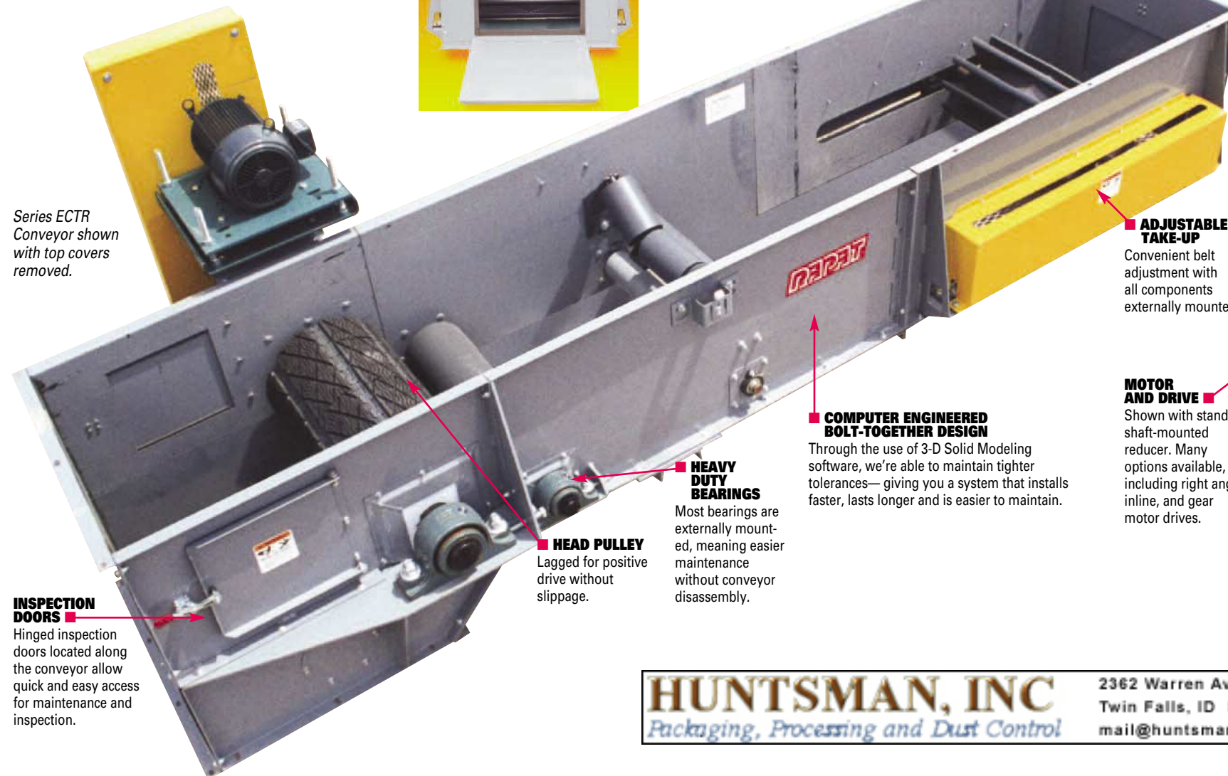
INSPECTION DOORS Hinged inspection doors located along the conveyor allow quick and easy access for maintenance and inspection.