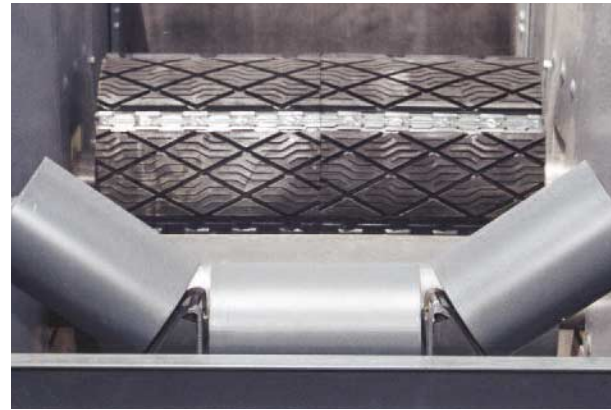
Above: CEMA standard 3-Roll Troughing idlers carry the load. Left: Snap-on cover attachment system means quick, easy enclosure access!