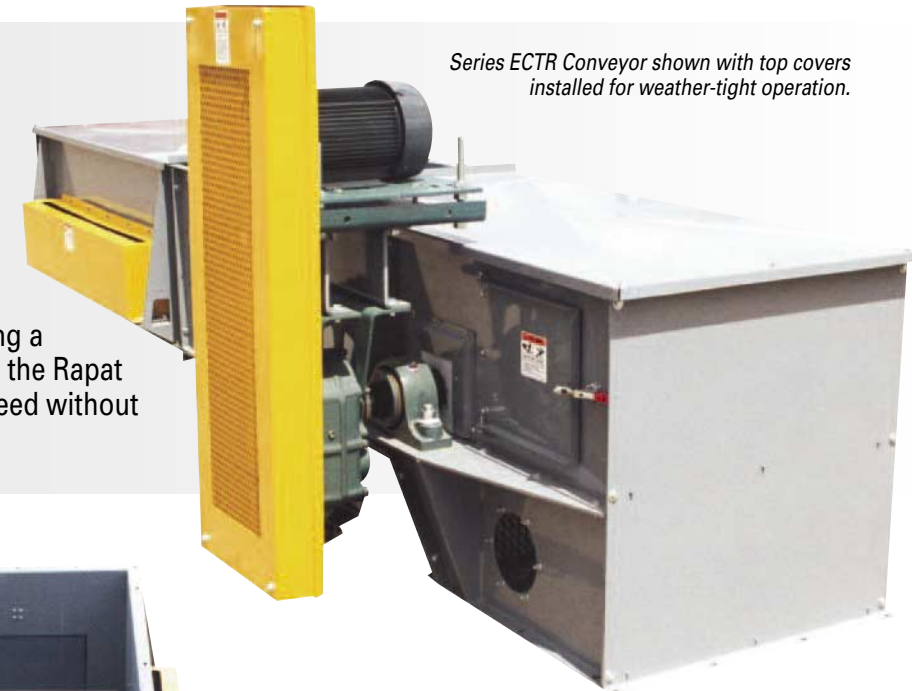
Series ECTR Conveyor shown with top covers installed for weather-tight operation.

Different installations have different requirements. Maybe you would like to keep the wind and weather away from your product, and require enclosure on the sides and top only? Our ECTR Conveyor will suit you perfectly! Or perhaps your installation is in a dust-sensitive area, and you need to keep potentially hazardous dust to a minimum— requiring a fully enclosed and sealed conveyor. In this instance the Rapat ECTR conveyor will provide the containment you need without sacrificing durability or performance.